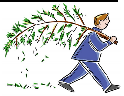
It's time to take down all of the beautiful Christmas decorations. Please join us on Sunday, January 5 , following the 11am service. Lunch will be provided.

We cherish you all and thank you all for your contributions to the Staff Appreciation gifts. It is an honor and a privilege to work with you.